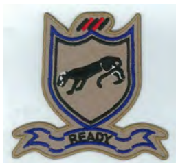
Ready 3 1/4" X 3"