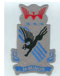
H/Minus 2 3/4" X 4"