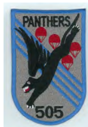
Panther 2 3/4" X 4"